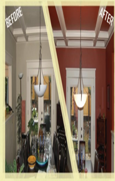
20 YEARS EXPERIENCE. FULLY INSURED. FREE ESTIMATES